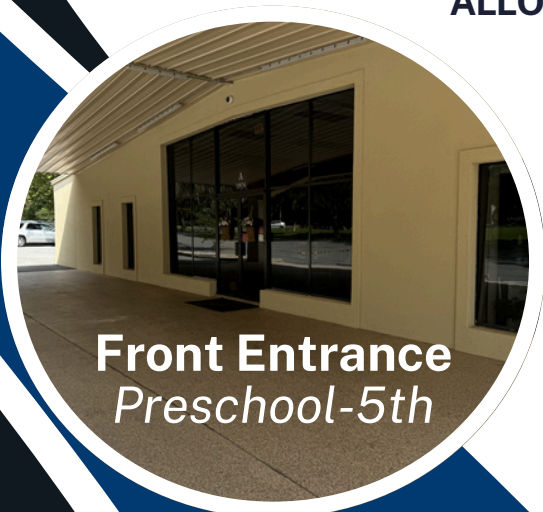
Front Entrance Preschool-5th

DO NOT DROP OFF STUDENTS IN THE PARKING LOT AND ALLOW THEM TO CROSS TRAFFIC